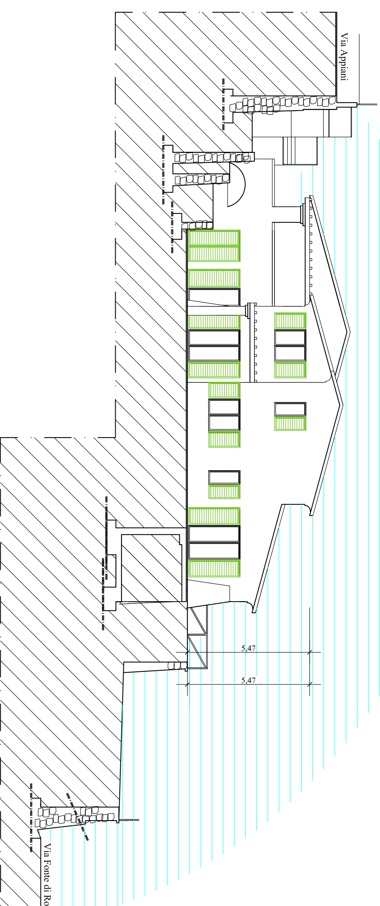
Prospetto lato Destro